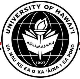
EXHIBIT 6.2 UHWO FACULTY GOVERNANCE