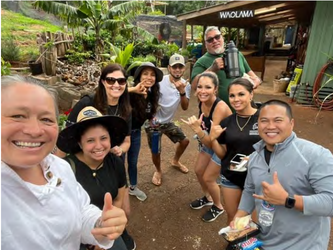
Waianae Health Academy nurses workshop on Ho'opono, June 9