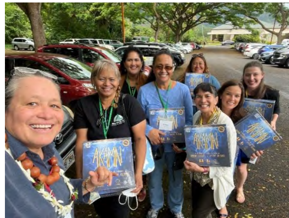
AKAMA'I – A family board game dedicated to 'ike Hawai'i is being launched this summer across ka pae 'āina o Hawai'i!