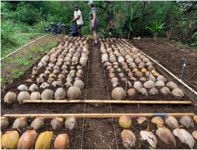
Niu Nursery @ Waianae Health Center, August 2021 (420 planted)