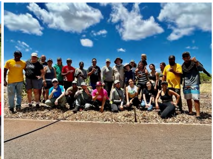
Uluniu Saturday Workday in July with New York GROW Externs!