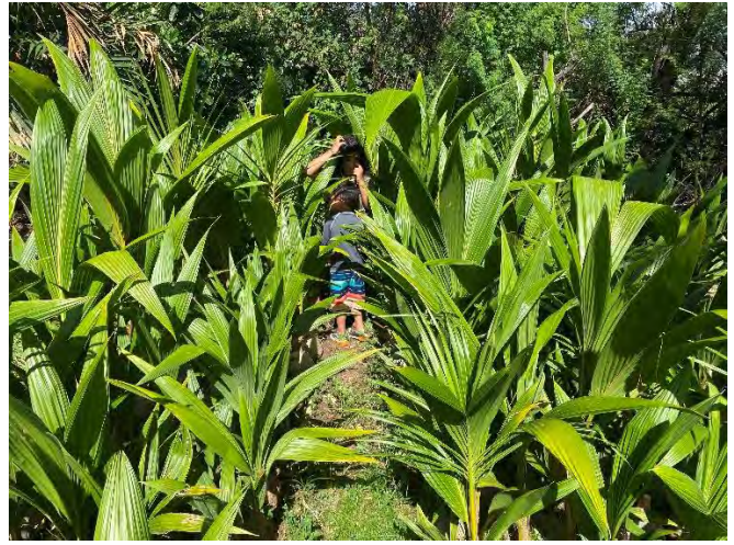
Same niu nursery today! All 400 coconuts to be gifted on Aug. 27