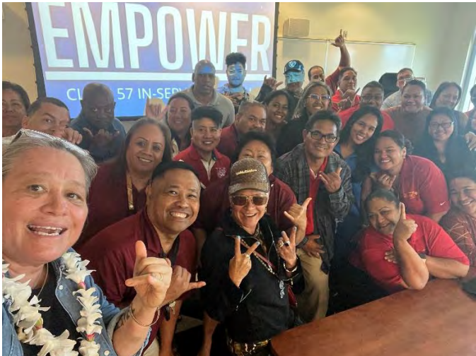
Youth Challenge Staff Workshop on Ho'oponopono, July 11