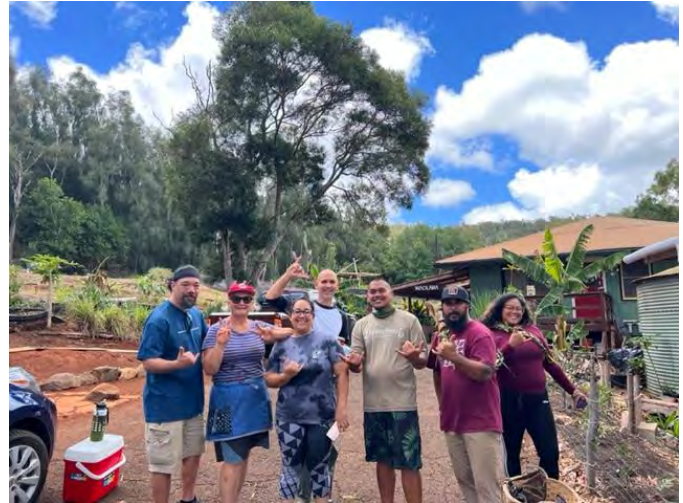
SCFS and Aloha 'Āina Student Club workday @ Palehua, May