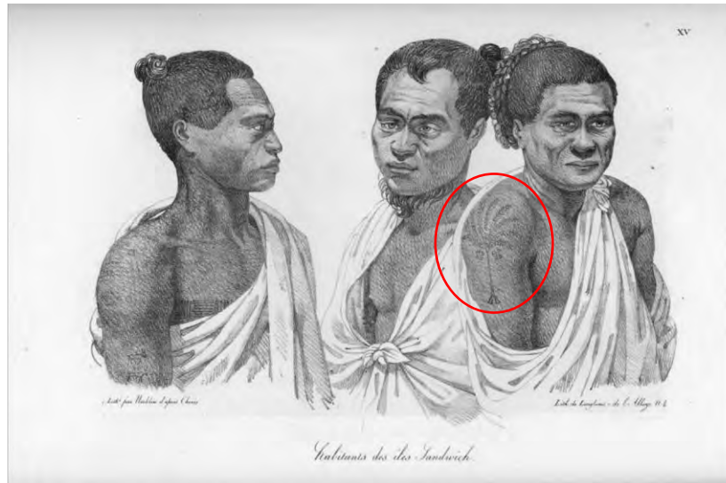
Inhabitants of the Sandwich Isles 1816-1817 Louis Choris