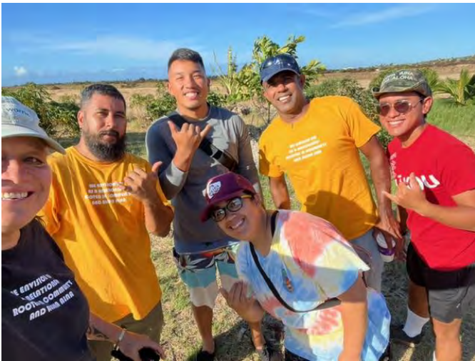
UHWO Aloha 'Āina Student Club members at Uluniu Project site